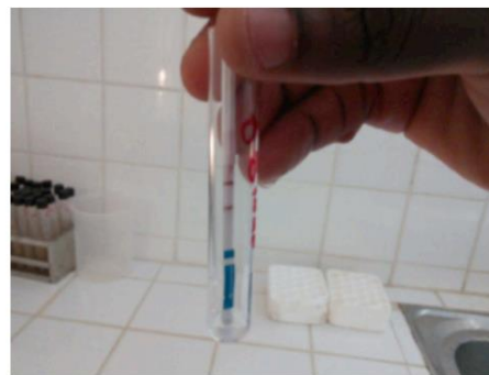
A positive sample

The upper line on each strip is the control. It must be present for all samples, positive or negative. Its absence means the test is invalid.