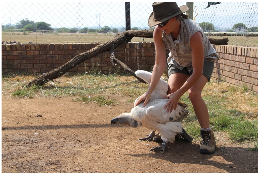
Figure 6: Releasing a vulture. Release the head and body simultaneously and step back slowly, allowing the vulture to decide where to move next.

Vultures, when given the opportunity will time their take-off to coincide with a thermal or an increase in wind strength, making the take-off easier. Birds in general prefer to take-off against the wind, and this should be considered when choosing the release site and direction. Releasing a bird from a crate should be done at ground level, and not from an elevated site such as the back of a vehicle. Pulling a bird out by a wing or the tail is unacceptable, as is tilting a crate to encourage a bird to exit. Give the bird time to leave the crate of its own accord.