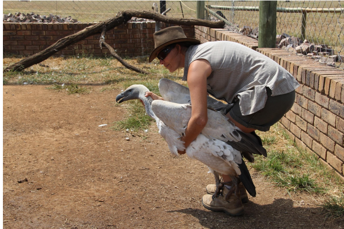
Figure 5: Preparing to release the vulture. The handler is going onto her haunches to bring the vulture to ground level.

When releasing a vulture, lower your body (Fig. 5), bringing the bird's feet to ground level, slowly allowing the bird to stand. Then release your grip on his entire body and neck at the same time, stepping away to give the bird some space (Fig. 6). Be careful never to drop or throw the bird down, nor allow the bird to fall prior to lowering it gently to ground level. When releasing the bird or placing it back inside the enclosure, remain still and allow the bird to walk or fly away from you, rather than panicking it, in which case it may take off, flying into stationary objects / fences. Do not force the bird to move. Allow the bird time to recover but monitor it for any unusual behaviour that could be a sign of heat exhaustion or injury from handling. The bird will decide for itself what to do next; it might fly off, run or drink water. Never force the bird to move or fly after the handling. Simply monitor and interfere only as a last resort if the bird appears not to be fit for release.