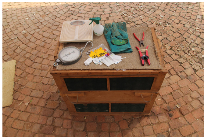
Figure 1: A vulture crate used as a processing table. The work space has been covered in a soft carpet and displays the necessary tagging tools and personal protection gear.

Suitable eye and face protection, gloves, a long-sleeved shirt, trousers and closed shoes are necessary when working with vultures. One of the best tables for processing vultures is a vulture crate covered with carpet for the bird's comfort (Fig. 1). Alternatively, a sturdy folding table measuring 1.5 x 0.7m will suffice. This allows easy access from all sides for the team to work on the bird. Catching and handling vultures may result in serious and sometimes permanent injuries. Pay particular care when holding the bird or replacing it on the ground to keep your face away from the beak.