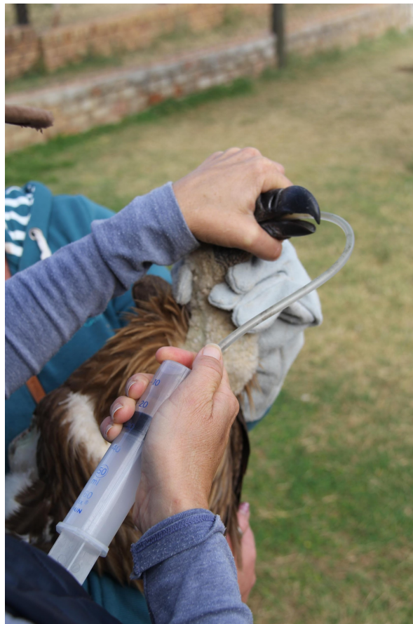
Figure 7: Given fluids orally, securing the head and beak and safely inserting the tube down the bird's beak and into the crop

the tube feels obstructed, take great care to assess that the tube is being sent down the correct pathway. In Gyps vultures, you will be able to see the tube moving down the neck. In other bird species where the neck is feather-covered, the tube can easily be felt as it is passed down. If you cannot see the tube moving down the neck, remove the tube and try again. The tube should be inserted all the way down the neck into the crop. Again, DO NOT give fluids until you can visually or physically confirm that the tube is placed correctly and is all the way down into the crop. A large Gyps vulture or Lappet-faced vulture should receive up to 180ml of water, Ringer's lactate solution or other rehydrating solution at one time. You will see the crop expand with the fluids. If the bird is severely dehydrated, the crop will subside quickly and more fluids can be given. Do not give oral fluids to any bird who is not strong enough to hold their head up, otherwise they can regurgitate the fluid and inhale it, resulting in an aspiration, pneumonia, and almost certain death (Fig. 7).