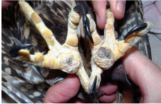
Figure 8: Image showing typical bumble-foot in a bird of prey's feet

The bird should be placed on a course of appropriate antibiotics (e.g. Nuflor) and the foot needs to be bandaged as per the instructions below. Preferably, take a microbiology swab for culture prior to administering any antibiotic. This information allows for a more directed antibiotic therapy and reduces the risk of resistance or treatment failure.