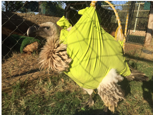
Figure 10: Cape Vulture in a sling

If there is no response or improvement within 2 weeks, the case is hopeless and the bird should be euthanised.