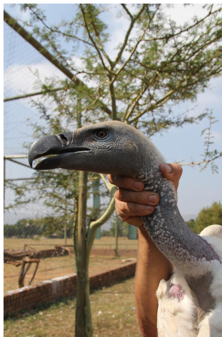
Figure 2: The proper hand placement to stabilize a vulture head

Once the selected vulture is within close reach, its neck should be grabbed from behind first, just below the jaw bone (Fig. 2). Do not grab the head from the front as you can crush the trachea, potentially causing permanent and irreversible harm. Do not grab lower than the jaw bone as the bird can turn its head around and bite you. Do not grab higher as you will lose your grip and may cause injury to the head, especially the ears or eyes of the bird. Use your thumb and forefinger around the back of the neck from behind the bird's head. Reach your fingers around to be against but below the jaw bone with the pressure on the sides of the neck to avoid suffocating the bird by constricting the trachea. You can be firm but not rough or too tight so as to avoid harming the bird. Great care should be taken with the hand holding the head. The head should always be held far enough away from your face and other body parts, as well as other people in your proximity. Vultures are extremely strong and can lunge and bite suddenly in defence, even when appearing calm. This can result in serious injury.