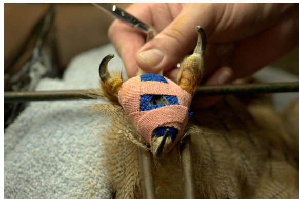
Figure 9: Doughnut-shaped bandage, note the hole in the middle of the bandage

A dry and cracked foot (but not swollen or apparently infected) such as that shown above is best treated with Preparation H (ointment rather than the gel version), by daily application for 2 weeks. Preparation H is a human treatment for haemorrhoids and is safe for use, whilst some other haemorrhoid treatments containing local anaesthetic (any drug with an 'aine' in the name) are toxic to birds.