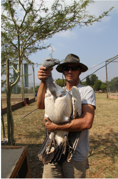
Figure 3: The proper way to hold a large vulture. The head is secured in one hand while the body, wings, and feet are restrained by 'hugging' the vulture.